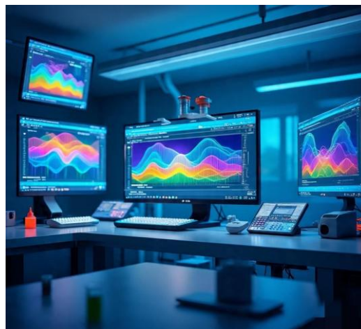
Figure: 5. With a focus on multi-omics integration, interpretability, and clinical translation, this paper examines existing AI approaches for genetic biomarker identification, emphasizes important applications in illness diagnosis and therapy, and explores future perspectives.

This study reviews current AI methodologies for genomic biomarker identification, highlights key applications in disease diagnosis and treatment, and discusses future directions, emphasizing multi-omics integration, interpretability, and clinical translation [Figure:5] [78-84].