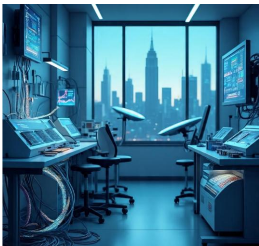
Figure: 1. Computational methods for examining genomic datasets, such as copy number variations, gene expression patterns, mutation data, and epigenetic markers

Emphasis is placed on AI methodologies such as supervised and unsupervised learning, deep learning architectures, and hybrid ensemble models for biomarker identification. The study addresses applications in multiple diseases, particularly cancer, cardiovascular disorders, and neurological diseases, demonstrating how AI can enhance predictive modeling for early detection, prognosis, and treatment selection [Figure:2][4].