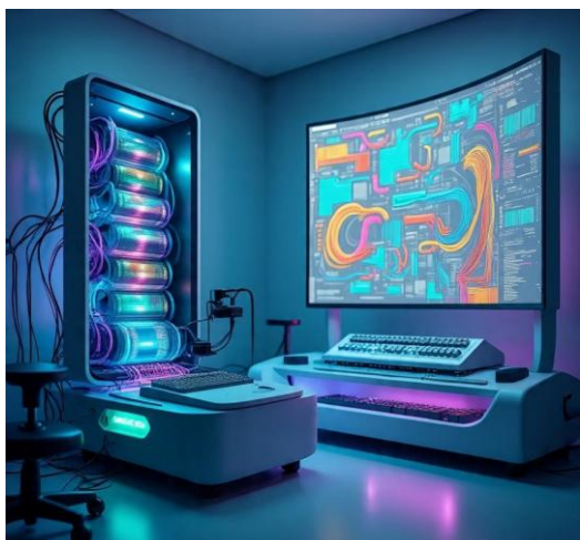
Figure: 4. Deep learning models, specifically convolutional and recurrent neural networks, have demonstrated exceptional performance in feature extraction from high-throughput genomic data, including single-cell RNA sequencing and whole-genome sequencing.

dimensionality reduction techniques like principal component analysis (PCA) and autoencoders, can reveal novel biomarker signatures without prior labeling. Deep learning models, particularly convolutional and recurrent neural networks, have demonstrated exceptional performance in feature extraction from high-throughput genomic data, including single-cell RNA sequencing and whole-genome sequencing [Figure:4] [31-45].