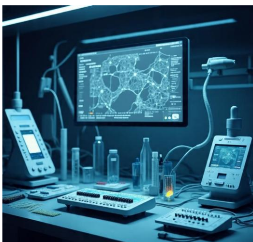
Figure: 2. The study shows how AI might improve predictive modeling for early identification, prognosis, and treatment selection in a variety of diseases, including cancer, cardiovascular conditions, and neurological problems.

Emphasis is placed on AI methodologies such as supervised and unsupervised learning, deep learning architectures, and hybrid ensemble models for biomarker identification. The study addresses applications in multiple diseases, particularly cancer, cardiovascular disorders, and neurological diseases, demonstrating how AI can enhance predictive modeling for early detection, prognosis, and treatment selection [Figure:2][4].